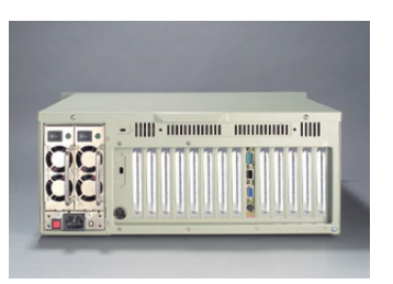
Rear view of IPC-610BP-H